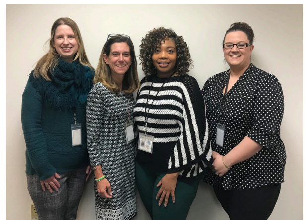
Division of Developmental Disabilities