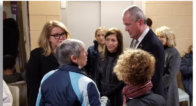
The Governor and Commissioner joined the First Lady to meet with New Jerseyans at the Rescue Mission of Trenton.