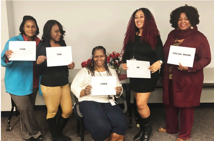
Division of Developmental Disabilities Voorhees Community Services Office