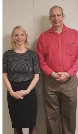
Division of the Deaf and Hard of Hearing