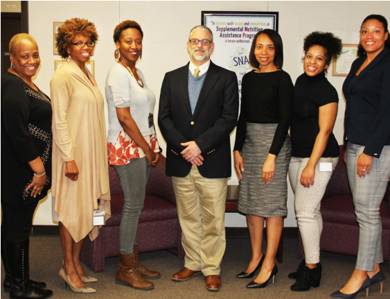
Division of Family Development

Social workers help families address challenges and identify opportunities. In recognition of Social Work Month, we thank the social workers of NJ Human Services who help New Jersey residents everyday!