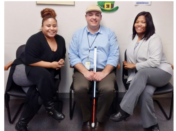
Commission for the Blind and Visually Impaired