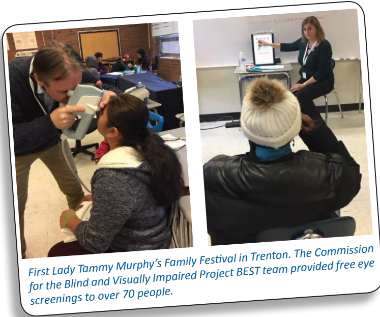
First Lady Tammy Murphy's Family Festival in Trenton. The Commission for the Blind and Visually Impaired Project BEST team provided free eye screenings to over 70 people.