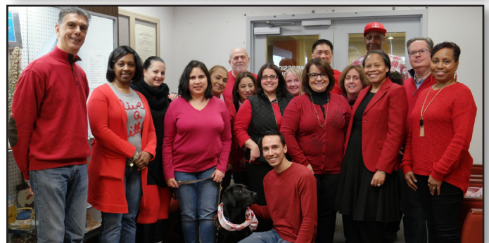
NJ Human Services had a strong showing on National Wear Red Day to raise awareness about heart disease.