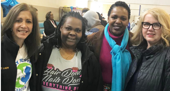
First Lady and Commissioner with doulas at the First Lady's Family Festival in Camden.

The Governor noted some of these important initiatives in his Budget Address . Among the highlights is our proposal to add doula services to NJ FamilyCare, our Medicaid program. First Lady Tammy Murphy has been leading a statewide campaign called Nurture NJ focused on reducing the unacceptable disparities in infant and maternal mortality in our State. Doulas support healthy pregnancies by providing culturally appropriate social and emotional support to pregnant women. The Governor's budget plan includes $1 million to implement doula coverage in Medicaid .