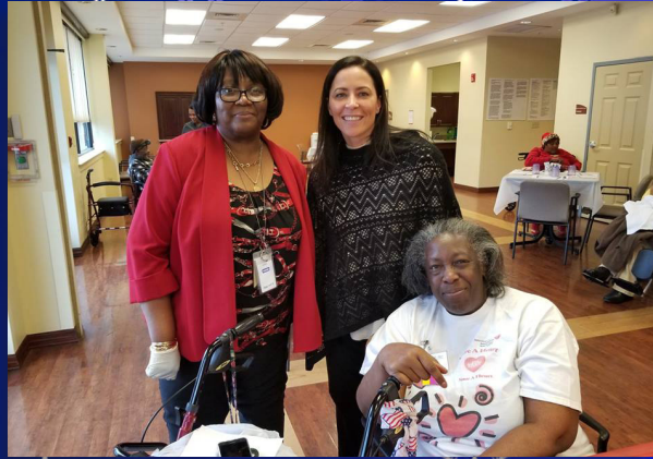
Staff from Medicaid and the Division of Aging took part in a Season of Service event, decorating holiday cookies with participants at the Lourdes Health Systems' Program of All-Inclusive Care for the Elderly (PACE).