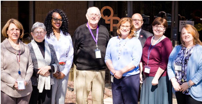
Division of Aging Services