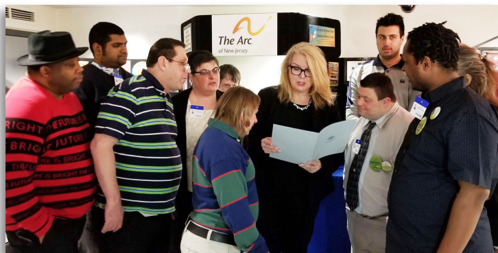
Commissioner Johnson presented The Arc of New Jersey & the New Jersey Self Advocacy Project Governor Murphy's proclamation commemorating Developmental Disabilities Awareness Month and highlighting the administration's commitment to supporting individuals with developmental disabilities & families.