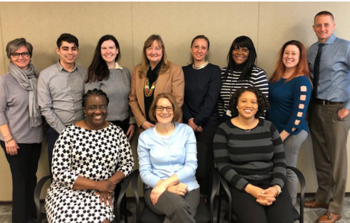
Division of Mental Health and Addiction Services