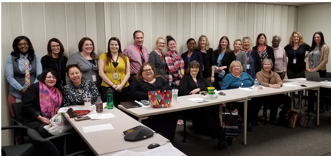
Office of the Public Guardian