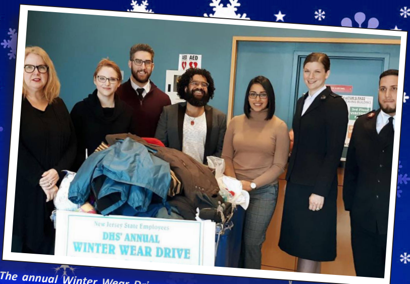
The annual Winter Wear Drive was as successful as ever this year! Thank you to DHS staff who donated more than 100 items including coats, scarves, gloves, mittens, and much more. Donations were made to the Salvation Army of New Jersey.