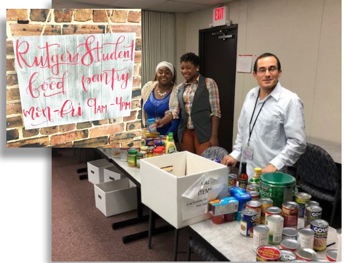
Division of Family Development conducted a food drive to stock college pantries.